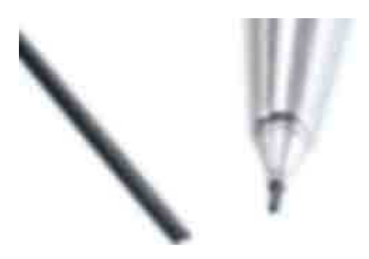
Conductive rubber 5750 series can be made as small as the tip of a pen