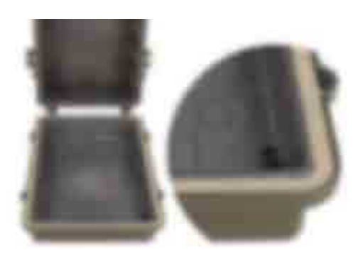
Conductive rubber 5750-S series cut according to customer drawing